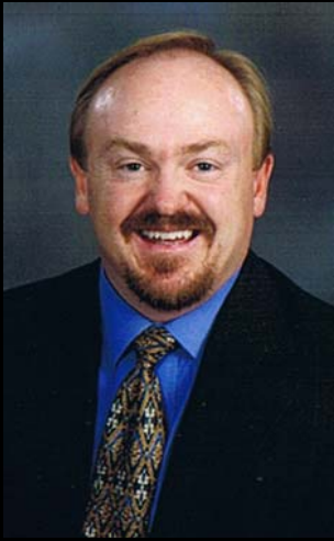
from the senior pastor